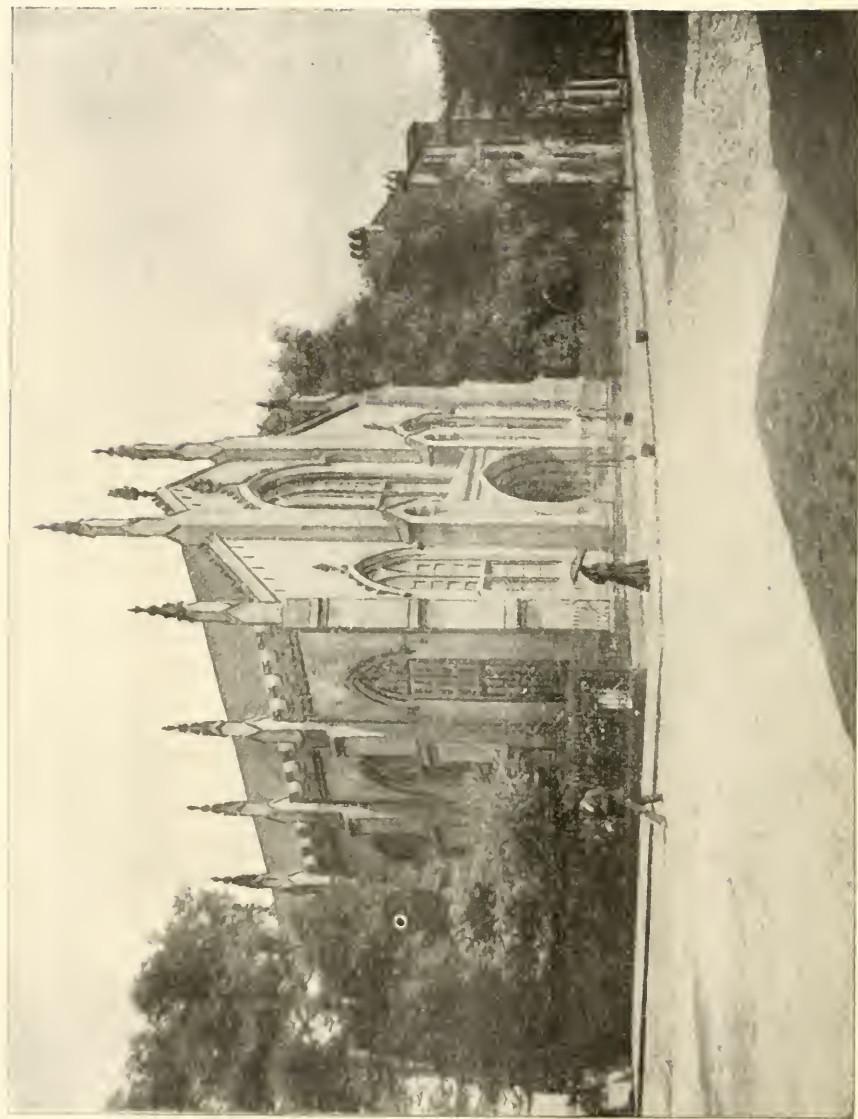
HUGUENOT CHURCH, CHARLESTON, S. C.