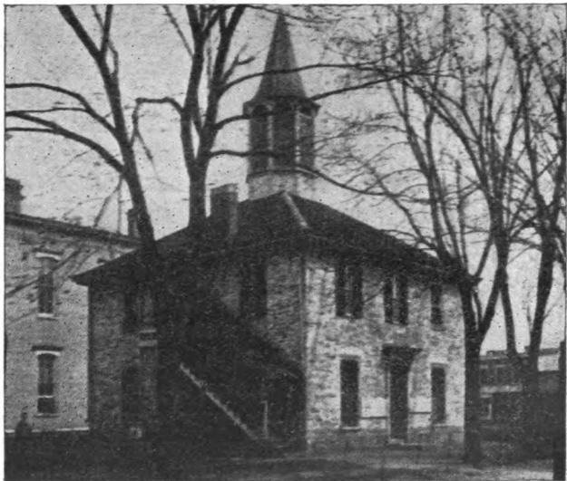
INDIANA'S FIRST CAPITOL.

populace that General John Morgan and his gang of "Guerillas" were coming to destroy Corydon. In 1873, the building was remodeled. The steps were removed to the outside where they are now located and the old stone floor gave way to a modern wood floor. The