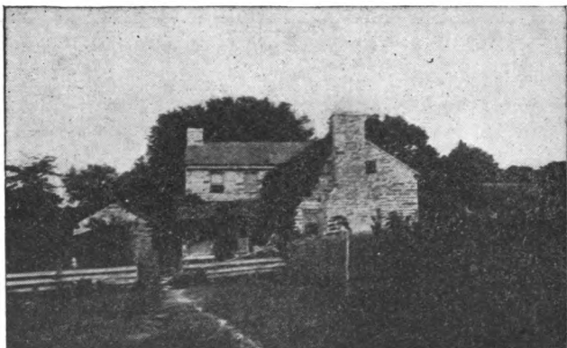
THE OLD CAPITAL HOTEL.